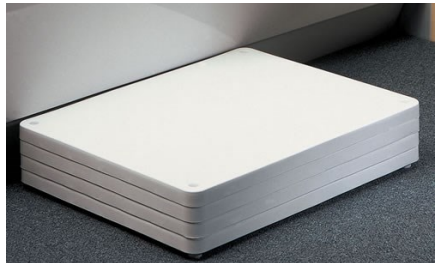
Adjustable Height Bath Step - Four interlocking components. Maximum height 4"/ 10.5cms. Non slip surface. Slip resistant feet.