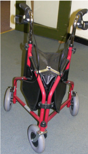
Z-Tec 3-wheeled Rollator with shopping bag. Hardly used.