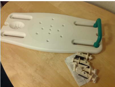
Bath Board. Fixings Included. Never used.