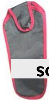
Folding Walking Stick carry pouch.