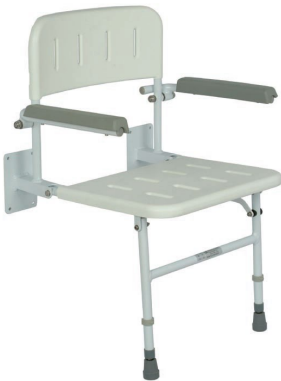
Impey Deluxe fold down Shower Seat - fits to wall of shower cubicle (screws not provided) Height adjustable. Never used. Cost £250 new.