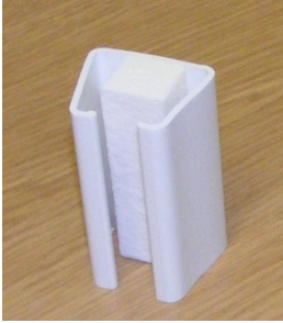
Unihold PVC Walking-stick Holders (Pack of self-adhesive to any smooth surface).